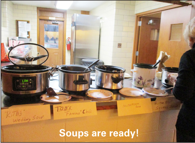
Soups are ready!

Due to a large increase in Goodyear Metro Park's weekend rental fees, Soup & Chili had to be moved to the first Thursday of November. We also contained costs by moving to the smaller West Room. It proved to be more than adequate for our 30 attendees.