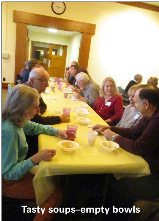
Tasty soups—empty bowls

Mark your calendar now and plan to join us on Thursday, November 2, 2023 for the next Soup & Chili Supper.