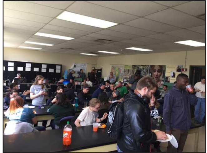
The spring picnic was held inside due to weather, but it didn't dampen anyone's spirit!