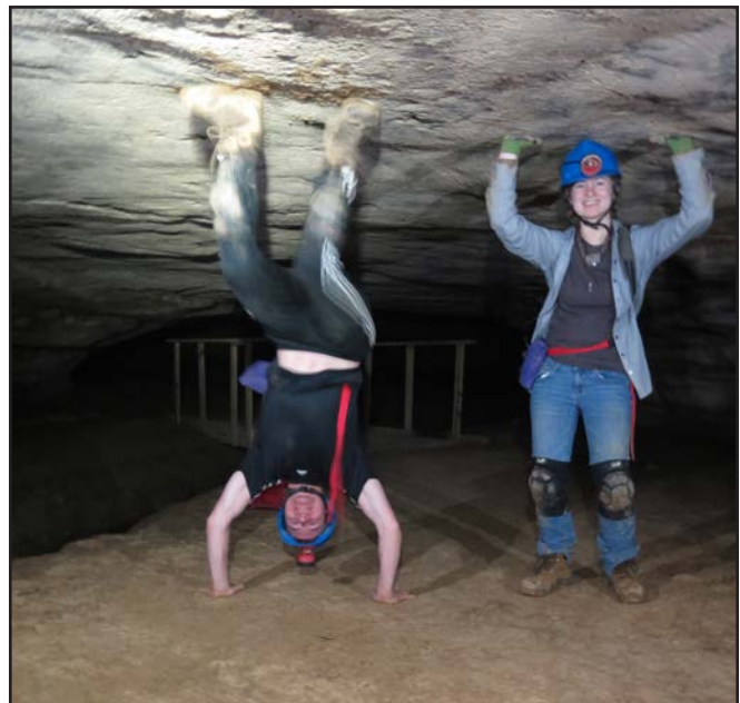
Which way is up? Mammoth Cave field trip 2017.