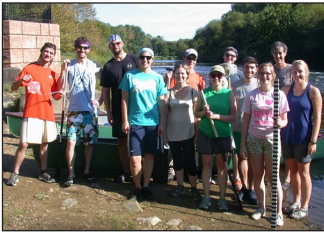
Rivers field trip 2017.