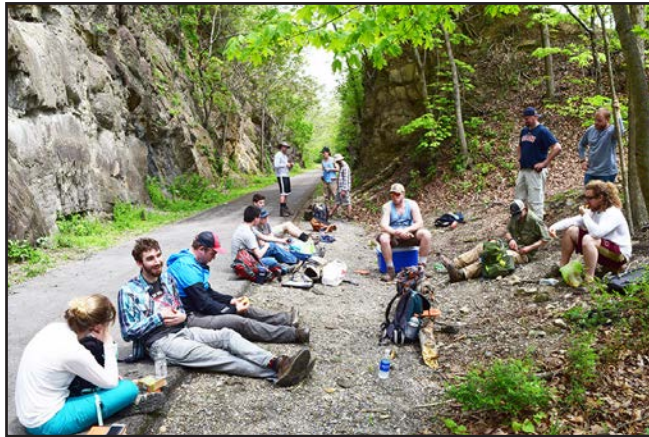
Advanced Structure students taking a lunch break during field trip to analyze folded rocks in Hancock MD, 2017.