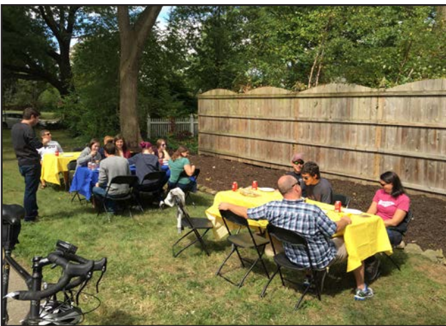
A perfect day for a picnic in the sunshine, relaxing, making memories with good food and good friends!