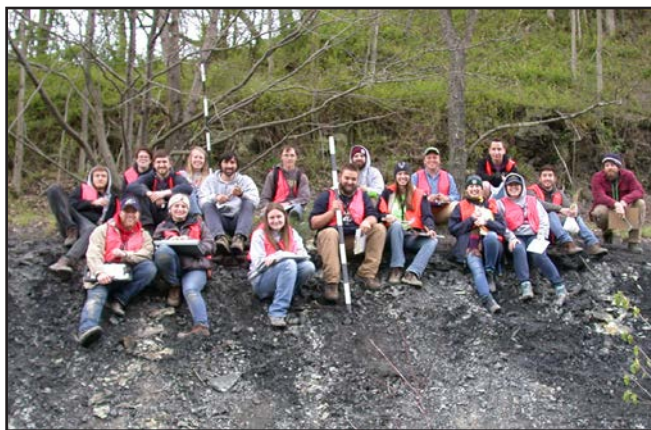
Sed Strat Field Trip 2017.