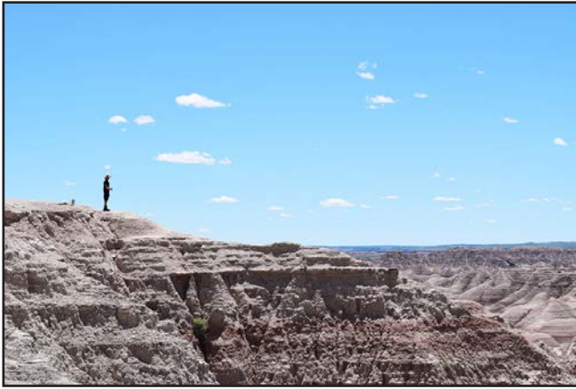
Graduate Student RJ McGinnis contemplating the need for proper hydration at Badlands National Park, South Dakota, June 2017.